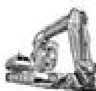
EARLY CRAWLER EXCAVATORS