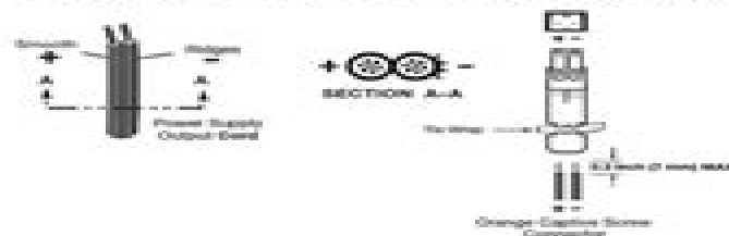
Figure 2. Power Connector Wiring