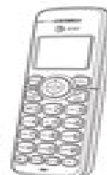
Cordless handset (1 for EL52119) (2 for EL52219) (3 for EL52319) (4 for EL52429)