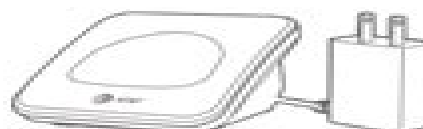
Charger for cordless handset with power adapter installed (1 for EL52219) (2 for EL52319) (3 for EL52429)