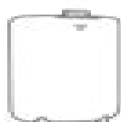
Battery compartment cover (1 for EL52119) (2 for EL52219) (3 for EL52319) (4 for EL52429)