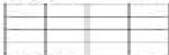
Human cell (sperm)