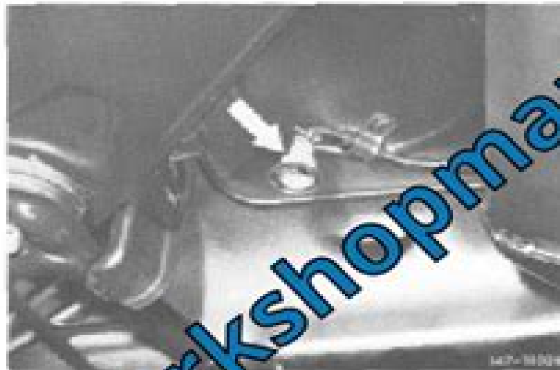
Fig. 30 Arrow, old version

The diaphragm will increase the pressure in the tank by approximately 10 mbar. This increased pressure causes an earlier shut-off of the automatic nozzle at the filling station.