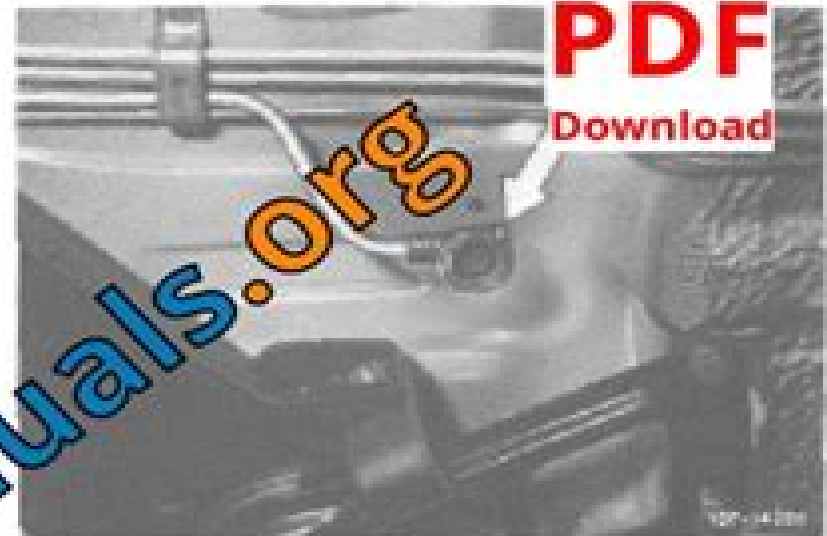
Fig. 31 Arrow, new version