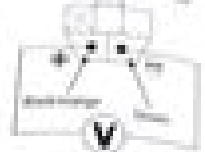
FUEL PUMP OF GDI SYSTEM