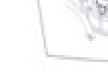
FUEL RETURN LINE