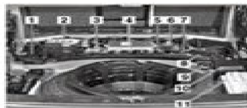
Locations of hundreds of electrical components. Communication equipment under trunk floor. ECL Electrical Component Locations