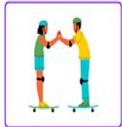
Newton's Third Law of Motion