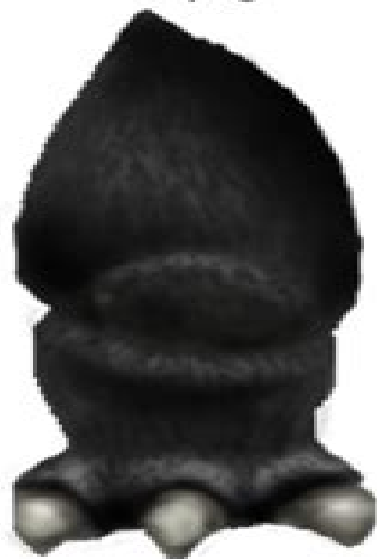
Right Leg Attach to "A"