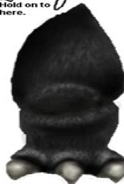
Left Leg Attach to "B"