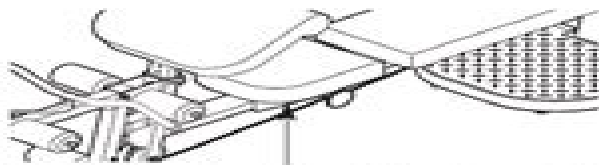
Serial Number Decal (under seat)

Write the serial number in the space above for future reference.