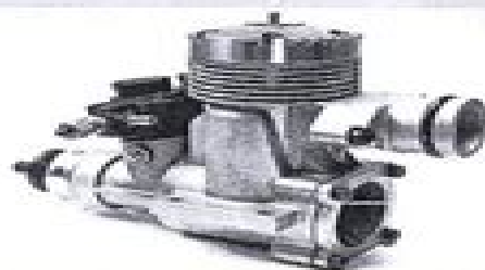
Nicely proportioned and sturdy looking, the 61-RE is largest, most powerful Irvine.