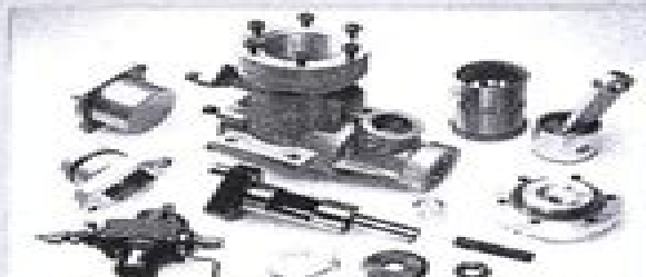
Parts of Irvine 61-RE. Engine uses investment casting for many components.