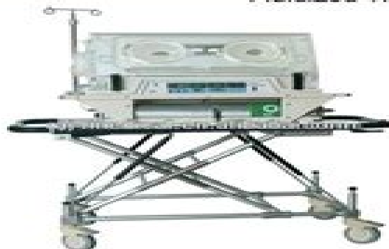
Transport Infant Incubator