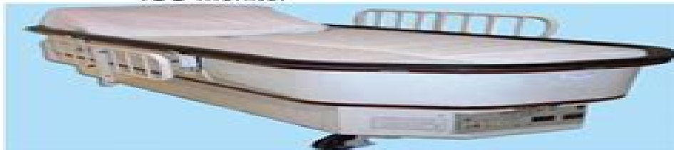
Fluidized Therapy Bed