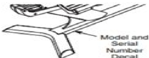
Model and Serial Number Decal

The model number and serial number are found in the location shown below. Write the model number and serial number in the space above.