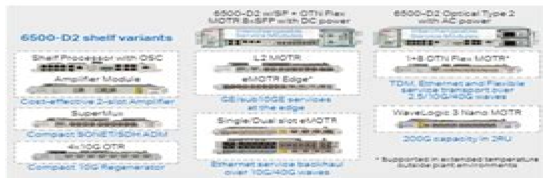
Figure 1. 6500-D2 Flexible configurations for various small office applications.

The 6500-D2 is a 2RU chassis composed of two service card-carrying slots enabling customized configurations for the strictest connectivity requirements at the access edge. The 6500-D2 offers AC and DC powering options, providing flexibility to meet customer premises power requirements, as well as backplane connectivity between the service card slots offering increased scalability and service resiliency options. Additionally, its small footprint and light weight enable field installation by a single person at locations with limited real estate.