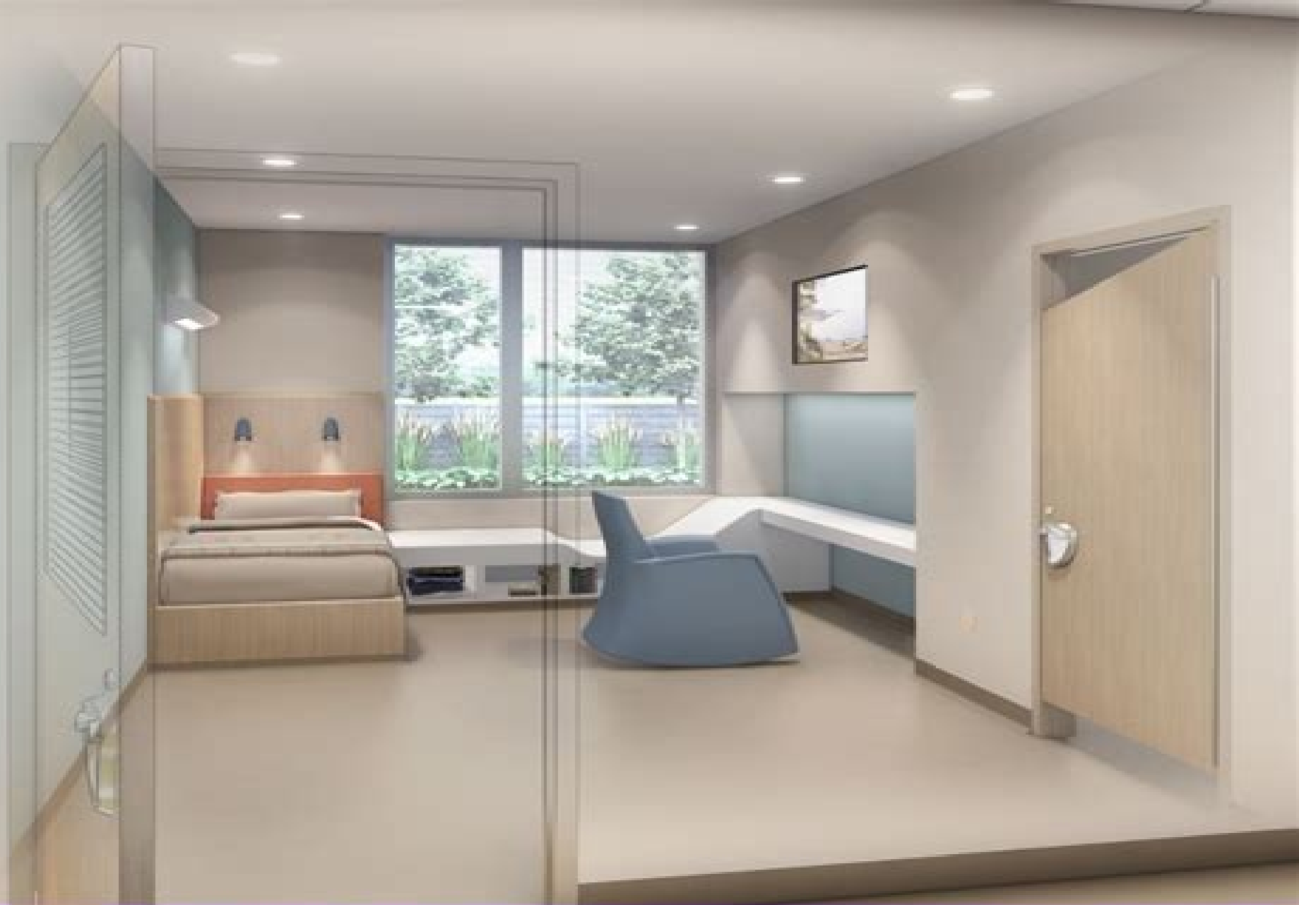
Behavioral and Mental Health Room