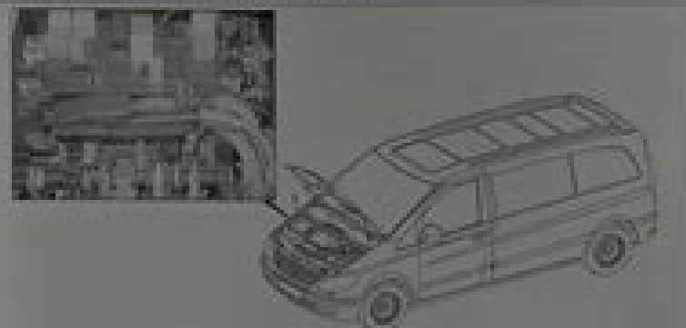
11. www.burton.com 12. www.burton.com