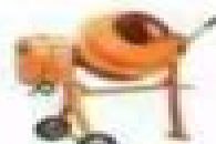
1/2 Bag Mini-mixer