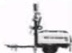
Mobile Light Tower