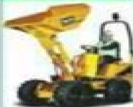
Mini Loader Dumper