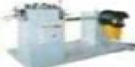
Sterilizing Machine Decoiling Machine