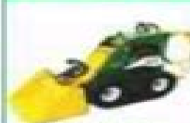
Loader Dumper Capacity 1st 2 Ton Prime mover -10hp 12 hp/4hp