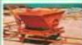
Slab Trolley Capacity 7 CFT Rail- 150 FT & 2 Barrel (40 x40 pipe)