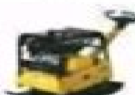
Reversible Motion Earth Compactor