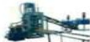
Brick Making Plant