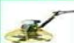
Power Trowel Capacity 3m2/hr Prime Mover - 3hp 5hp motor or 3hp petrol engine