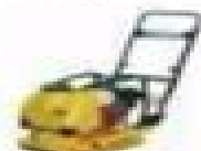
Forward Motion Earth Compactor