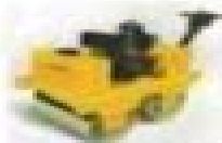
Walk Behind Roller