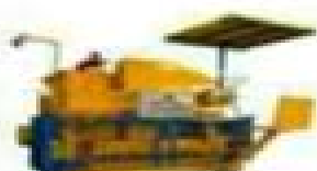
Teg Layer Block Machine