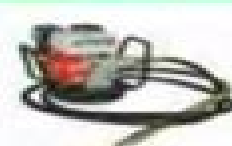
Engine Vibrator Petrol, Kerosene Engine Vibrator Headline - 40 60x 6000 length Prime Mover 2 hp Engine