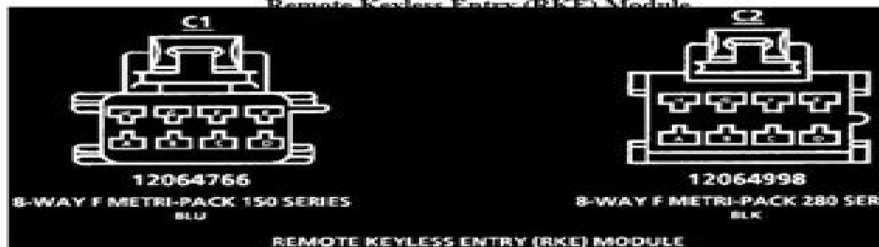
Remote Keyless Entry (RKE) Module