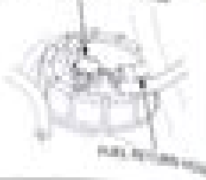
FUEL PUMP OF GDI SYSTEM