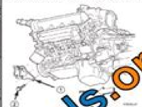
Fig. 34 Engine Insulator Mount Left Vehicle-Left Side 1 - ENGINE INSULATOR MOUNT LEFT SIDE 2 - ENGINE