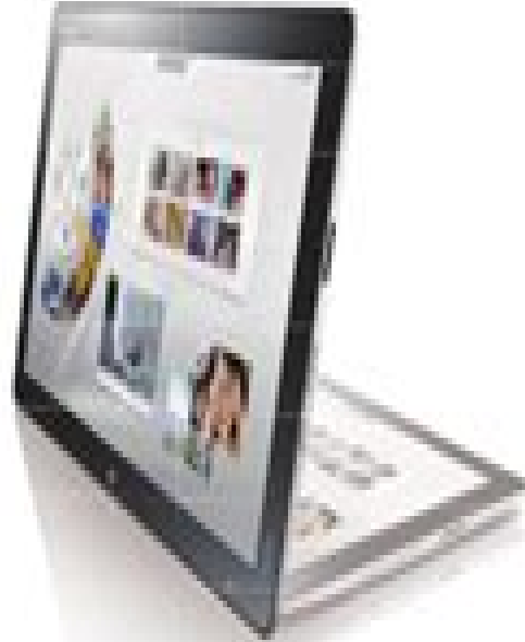
Lenovo HORIZON 28