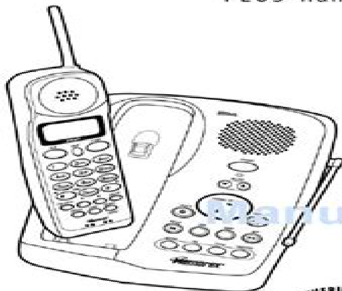
MPH6995 Caller ID Type II plus Handsfree Speaker phone Digital Answering Machine