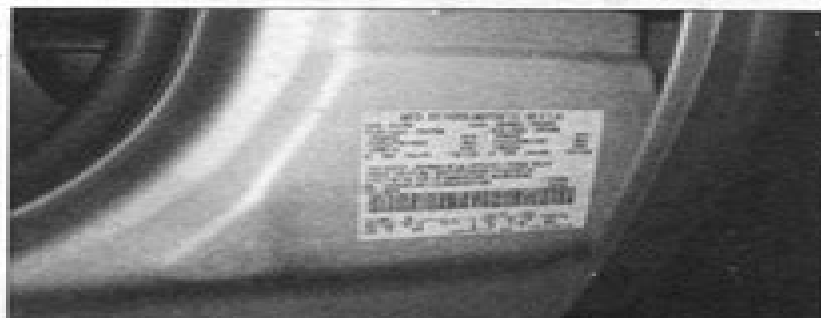
Location of the Manufacturer's Certification Regulation label

On V6 models, the engine identification number is stamped into a machined pad on the right end (driver's side) of the engine block (see illustration).