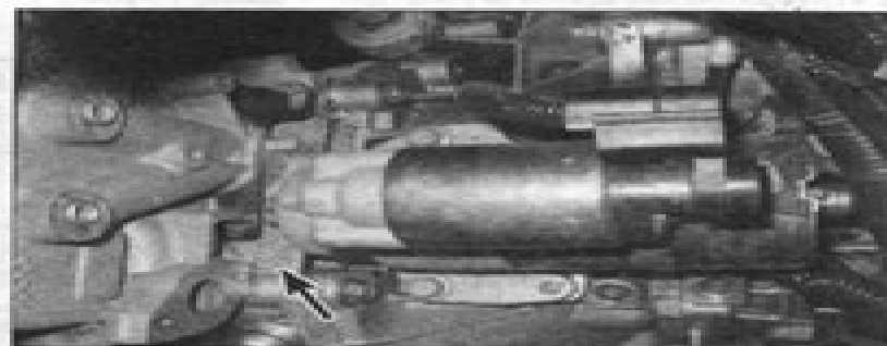
Location of the engine identification number - V6 engine