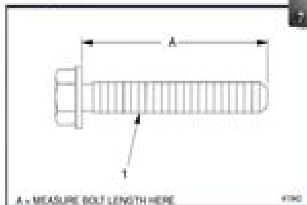
1. Main Bearing Cap Bolt