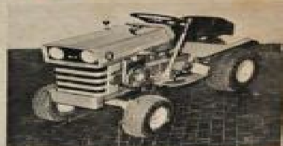
MF 8 LAWN TRACTOR AND MOWER