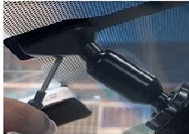
4. Tighten the screw on this bracket to fix it on the base.