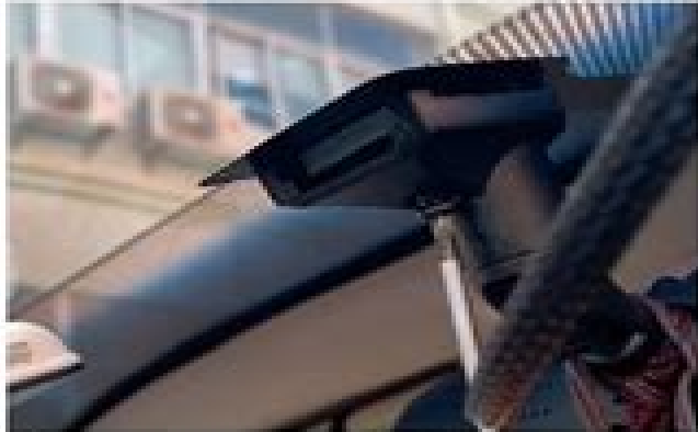
1. Remove your original rearview mirror.