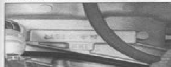
The engine number is located on the right side of the crankcase

Whether buying new, used or rebuilt parts, the best course is to deal directly with someone who specializes in parts for your particular make.