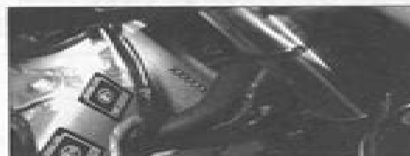
The frame number is stamped on the steering head . . .

* This digit in the frame number changes from one machine to another.