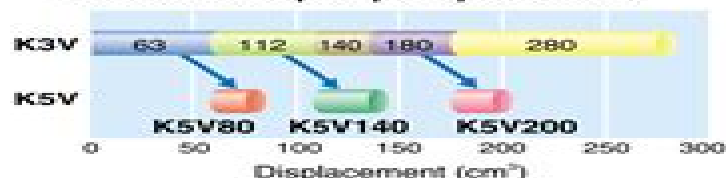
•Variation of pump displacement

With new technology the K5V series has enabled increased power density.