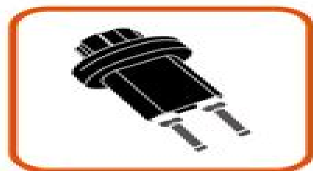
Mechanical Boost Controller