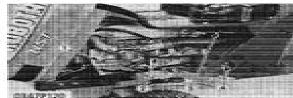
(6) 1P Connector