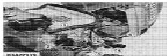
(2) Positive Cable