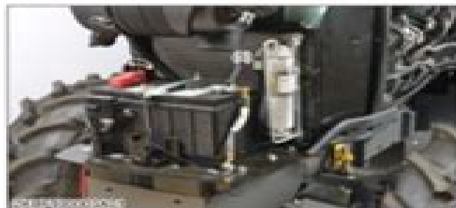
(5) Negative cable