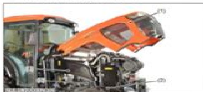
(1) Bonnet (2) Bonnet under cover (3) Side cover (4) Side bonnet