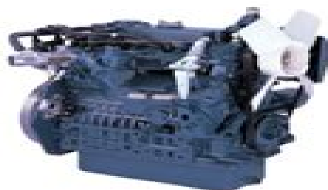
Photograph may show non-standard equipment.