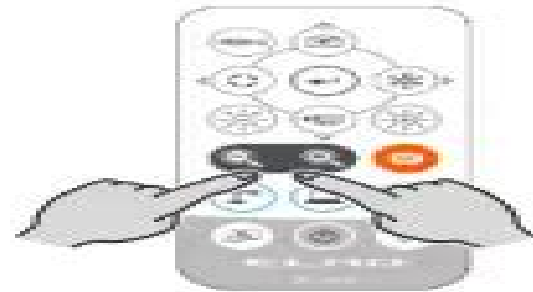
Zoom button on the remote control