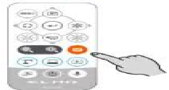
AF button on the remote control