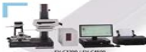
SV-C3200 / SV-C4500