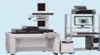
SV-3000C NC + QVP