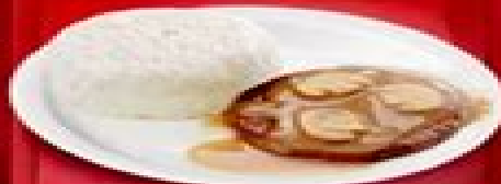
1-pc. Burger Steak