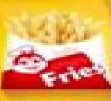
Jolly Crispy Fries