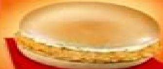
Crunchy Chicken Sandwich