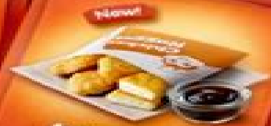
4-pc. Chicken Nuggets w/ Dip