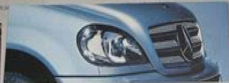
W-Class Operator's Manual