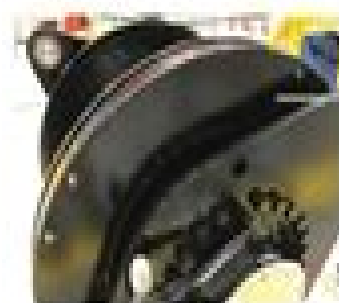
Drums 1, 3, and 4