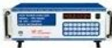
3 Phase Precision Power Analyser - VPA 60080