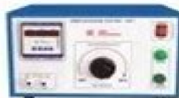
High Voltage Tester VHT-05