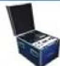
Digital Oil Breakdown Voltage Tester - VOTe