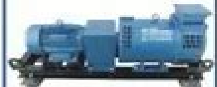
DVDF Motor Generator Set