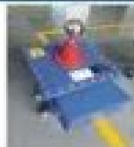
High Voltage Transformer