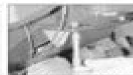
2-13: Radiator assembly (from side view of the radiator)