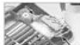
2-12: Radiator assembly (from top view of the radiator)