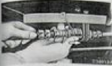
Abbildung 115: Ölwanne-Abstreifvorrichtung

Die Ölwanne-Abstreifvorrichtung ist eine Vorrichtung, die die Ölwanne des Motors abstreift. Sie wird durch einen Schalter an der Steuerkonsole bedient. Die Ölwanne-Abstreifvorrichtung ist eine Vorrichtung, die die Ölwanne des Motors abstreift. Sie wird durch einen Schalter an der Steuerkonsole bedient.