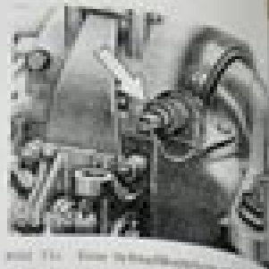
Abbildung 114: Ölwanne-Abstreifvorrichtung