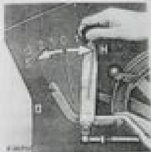
Abbildung 116: Ölwanne-Abstreifvorrichtung

Die Ölwanne-Abstreifvorrichtung ist eine Vorrichtung, die die Ölwanne des Motors abstreift. Sie wird durch einen Schalter an der Steuerkonsole bedient. Die Ölwanne-Abstreifvorrichtung ist eine Vorrichtung, die die Ölwanne des Motors abstreift. Sie wird durch einen Schalter an der Steuerkonsole bedient.