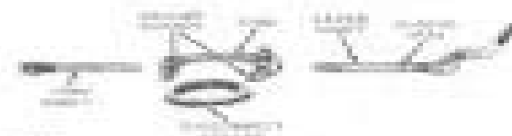
Fig. 100044-1 Gear Shaft and Pinion

Inspect the gear shaft and pinion (Fig. 100-10-044) for damage or excessive wear. Replace parts as necessary. Install a new O-ring seal on the gear shaft.