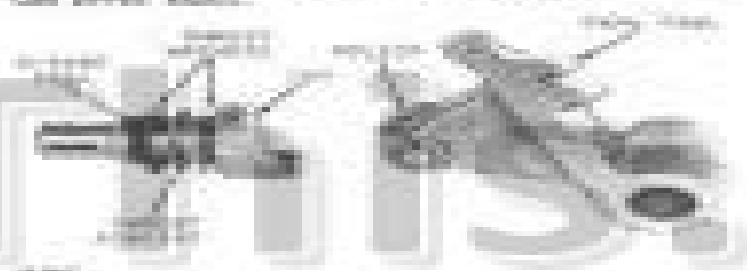
Fig. 100044-2 Gear Shaft and Pinion

Inspect the gear shaft and pinion (Fig. 100-10-044) for damage or excessive wear. Replace parts as necessary. Install a new O-ring seal on the gear shaft.