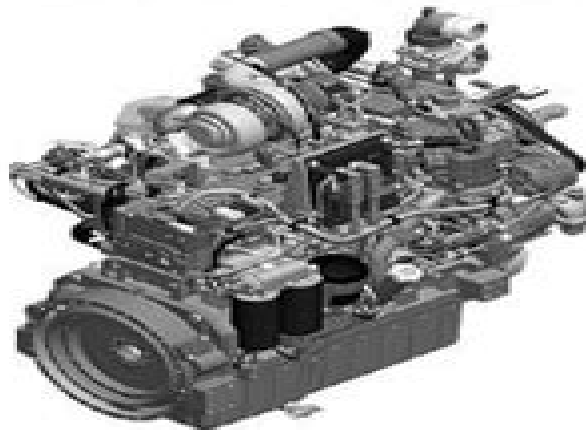
Final Tier 4 6000 Engine — Right Rear View