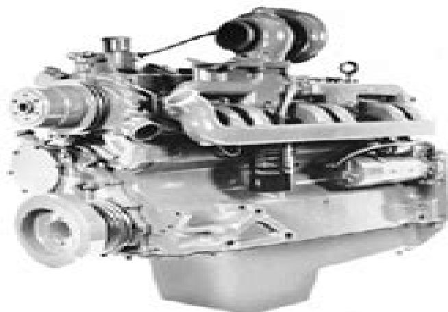
3/4 Left Front View 6101HZ Engine

Read each module completely before performing any service.