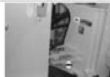
4 Front View of Ports

Lubricate daily when operating in sandy conditions such as deep track, sand, or snow.