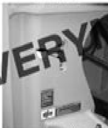
3 Power, Left Side View

Lubricate every 10 hours when operating in sandy conditions such as deep track, sand, or snow.