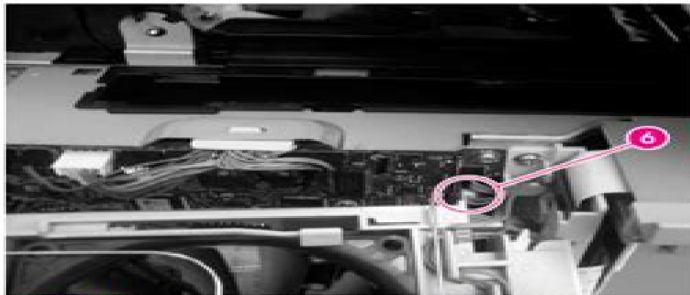
Figure 6-94 Remove the tray 1 feed-assembly (11 of 13)