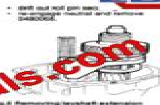
Fig. 5 Removing layshaft extension assembly