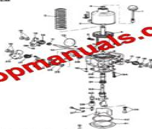
Fig. 9 COMPONENTS OF THE FUEL SYSTEM