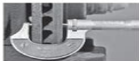
Measuring brake rotor wear. 00.04 Maintenance