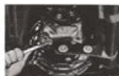
Fig. 4.4 Mounting the exhaust pipe support bracket on the manual generator