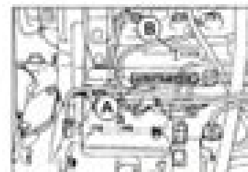
© 2000 Blackwell Science Ltd Journal of Internal Medicine 247: 395–401

THE UNIVERSITY OF CHICAGO PRESS, 50 EAST LEXINGTON AVENUE, NEW YORK, NY 10017-2453 212 850 6640 FAX 212 850 6098 E-MAIL: orderdept@lib.uchicago.edu http://www.uchicago.edu