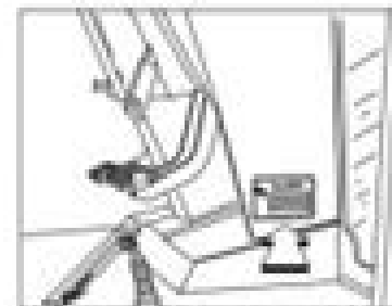
† Figure 1 has been moved to the end of this article.