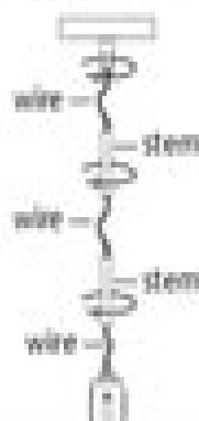
DIAGRAM 2: Feature mounting